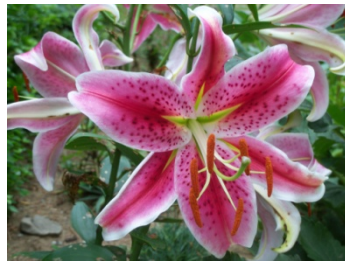
Lily Rubrum - similar to what will be delivered

Mixed Bouquet: 3 White Roses, 3 Pink Roses, 1 One Stem Lily Rubrum and Greens $26.00