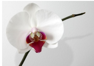
Phalaenopsis Orchid - similar to what will be delivered

Pin-on Corsage: White Phalaenopsis Orchid, Baby's Breath and Ribbon $8.00